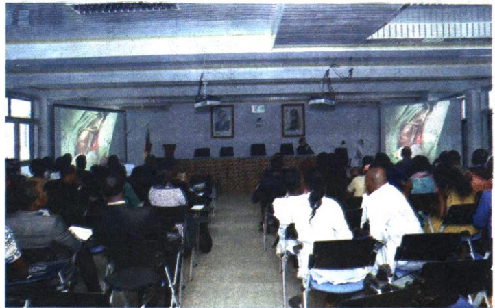
Conference venue where attendees viewed the live surgery

on the topic for the society as well as the step by step surgical technique of the procedure.